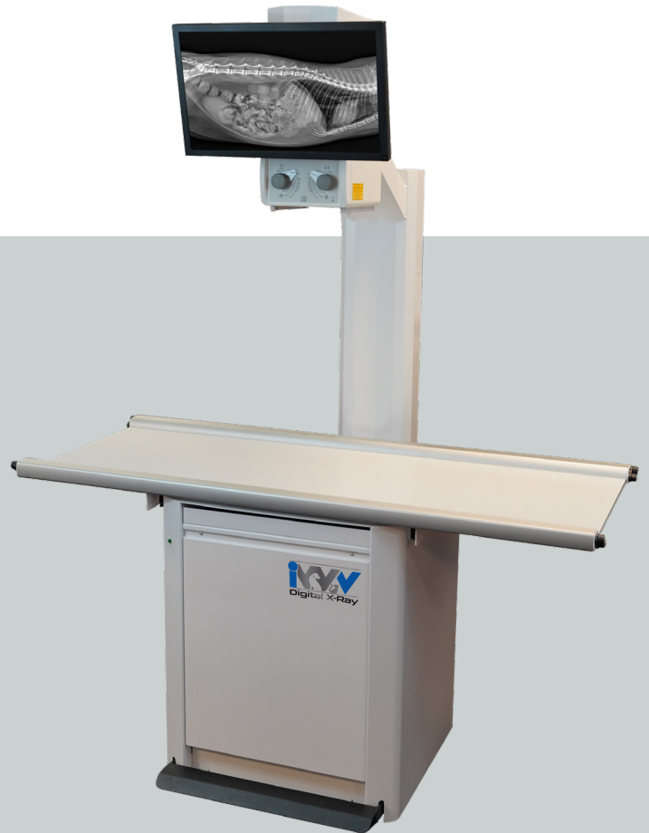
IWV System X